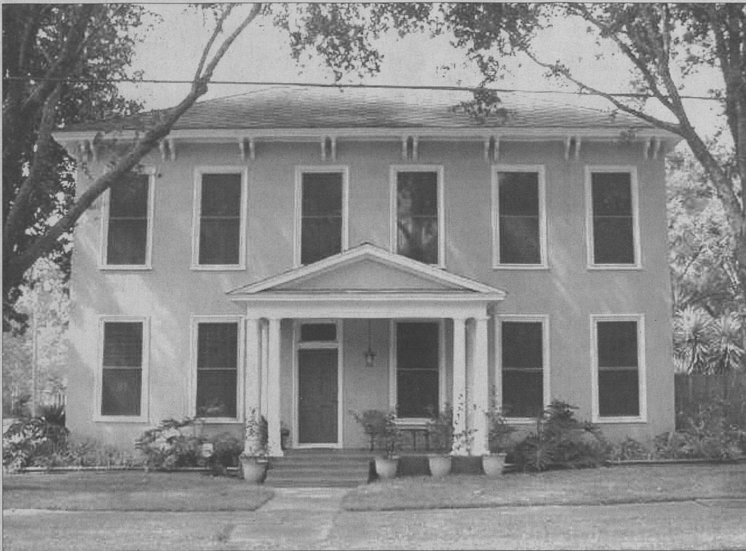
The first home on The Eagle Lake Civic Garden Club Holiday Homes Tour will be the Sidney and Barbara Struss home, located at 100 W. Stockbridge.